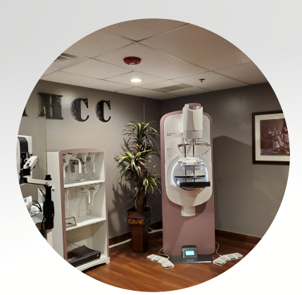
GE 3D Mammography

A joint partnership between MHCC and Fremont Therapy Group provides a large range of Physical Therapy and Rehabilitation services to Carbon County residents.